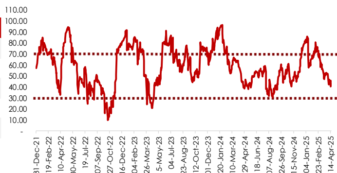
RSI of NGX All Share Index

We expect bearish sentiment to dominate the equities market in trading session, driven by a dip in banking stocks amid mark-d dividend distributions and uncertainty over global direction due to policy.